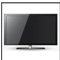
Television Voice Control