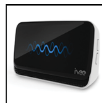
Consumer Electronics Voice Control